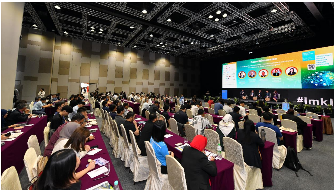
Intelligent Manufacturing Kuala Lumpur 2024